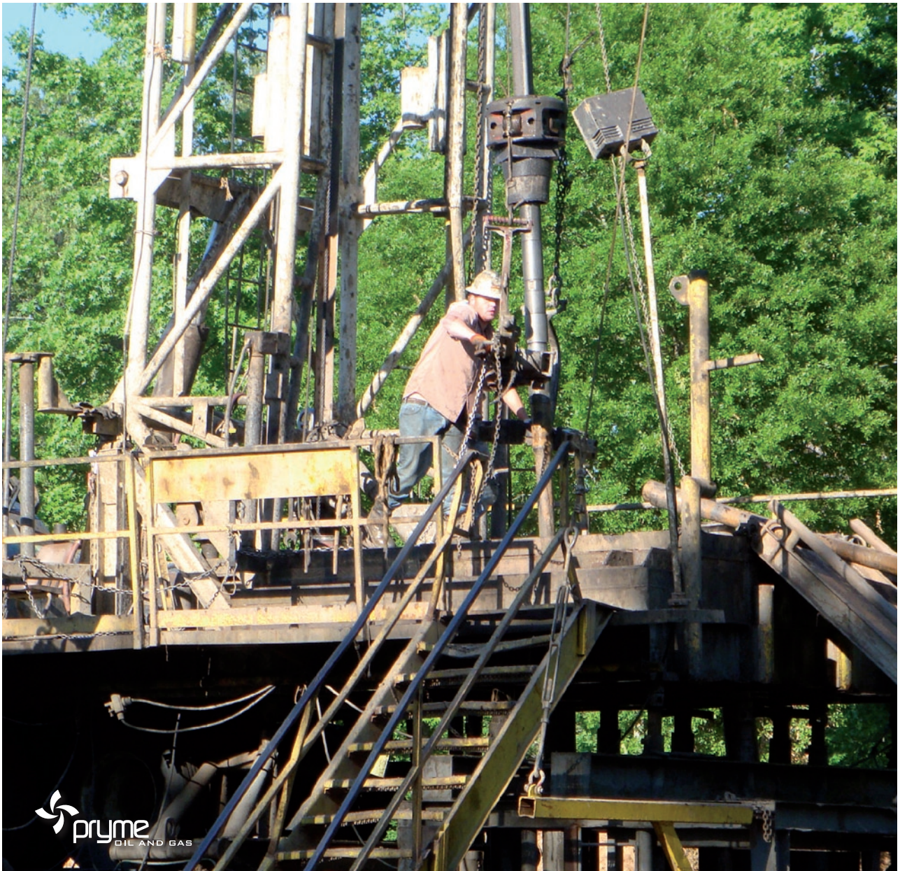
Drilling in the Four Rivers Project