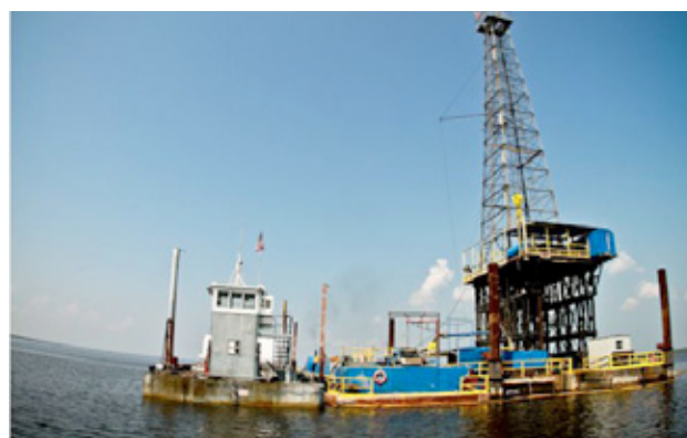
Barge drilling rig and associated equipment drilling in Catahoula Lake, Louisiana

* Pryme's 1P reserves shown in BOE and taken from Pryme's 1 July 2010 Reserves Statement released through the ASX on 16 July 2010. Further information on Pryme's reserves can be found at www.prymeoilandgas.com .