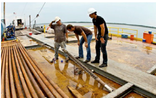
PLX Management inspecting core samples taken from the SL 502 No.1 Catahoula Lake, Louisiana

The State Lease 502 No.1 well is the first well to be drilled from PLX's barge rig in the Catahoula Lake Project. It was drilled to a total depth of 4,280 feet and intersected approximately 35 feet of net oil pay across multiple Middle Wilcox sands. The well was tied into production facilities in mid July and initially flowed in excess of 100 bbls/day. It is expected to produce at a long term stabilized rate around 50 bbls/day bringing current PLX production on Catahoula Lake up to approximately 100 bbls/day. PLX's Net Revenue Interest (NRI) in the State Lease 502 No.1 well is 75% (100% Working Interest).