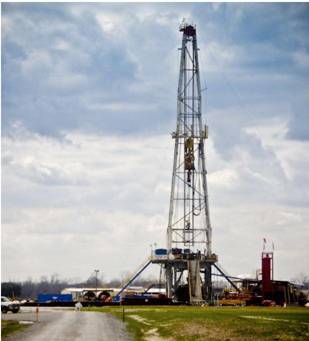
Drilling in the Austin Chalk, Avoyelles Parish, Louisiana

Drilling of the first well to test the Austin Chalk formation, the Deshotels 20-H No.1 well in North Bayou Jack Field, is expected to commence during the first week of August. Pryme's working interest in the well is 40%, equivalent to a 30% net revenue interest (NRI).