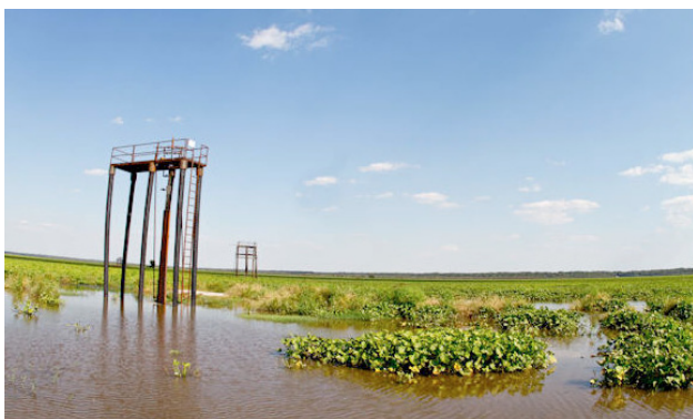
Preventative maintenance and pipeline work continues in the lake while the water level is low

The Company has reviewed the potential benefits from working over operating wells within the PLX 100% owned tenements in Catahoula Lake and expects that the workover of two or three wells should result in a significant increase in production for little outlay. Therefore, subject to weather or other events limiting access to the wells, PLX intends to work-over two or three wells prior to the end of 2010.