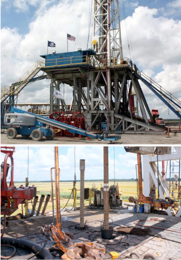
Drilling of the Deshotels 20-H No.1 well in the Turner Bayou Chalk Project

intersected. Several other deeper formations of interest were also present, they will be evaluated in due course.