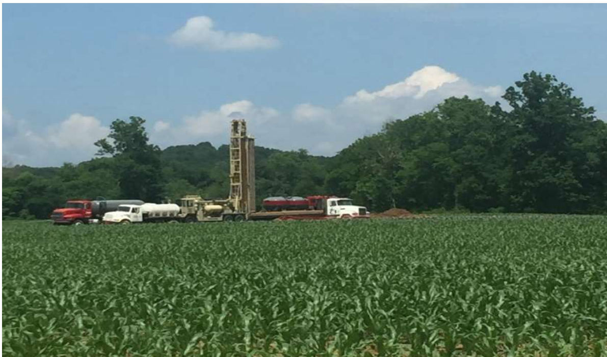
Figure 1 – Drilling the Weldon-Young #1A well in Kentucky

This initial Contingent Resource report confirmed significant oil in place in INK's initial project area, which is believed to also extend significantly beyond INK's leased acreage, providing scope for a sizeable project should INK's technologies prove technically and commercially successful.